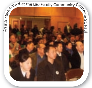
An attentive crowd

Summit is proud to be part of making this vision—a healthy economy and environment for all—a reality.